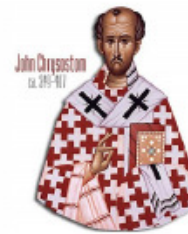
John Chrysostom ca. 349-403 Patron Saint of Sunday School

A Ministry of Christian Education at Saint George Antiochian Orthodox Cathedral, Coral Gables, FL