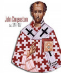
Patron Saint of Sunday School

A Ministry of Christian Education at Saint George Antiochian Orthodox Cathedral, Coral Gables, FL