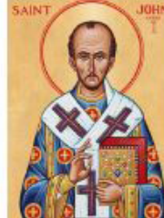
Saint John Chrysostom Sunday School Patron Saint