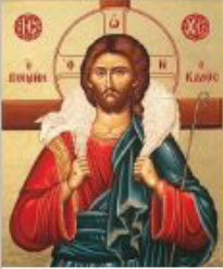
Christ The Good Shepherd