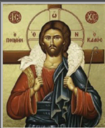
Christ The Good Shepherd