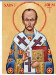
Saint John Chrysostom Sunday School Patron Saint