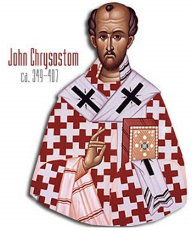
John Chrysostom ca. 349-407